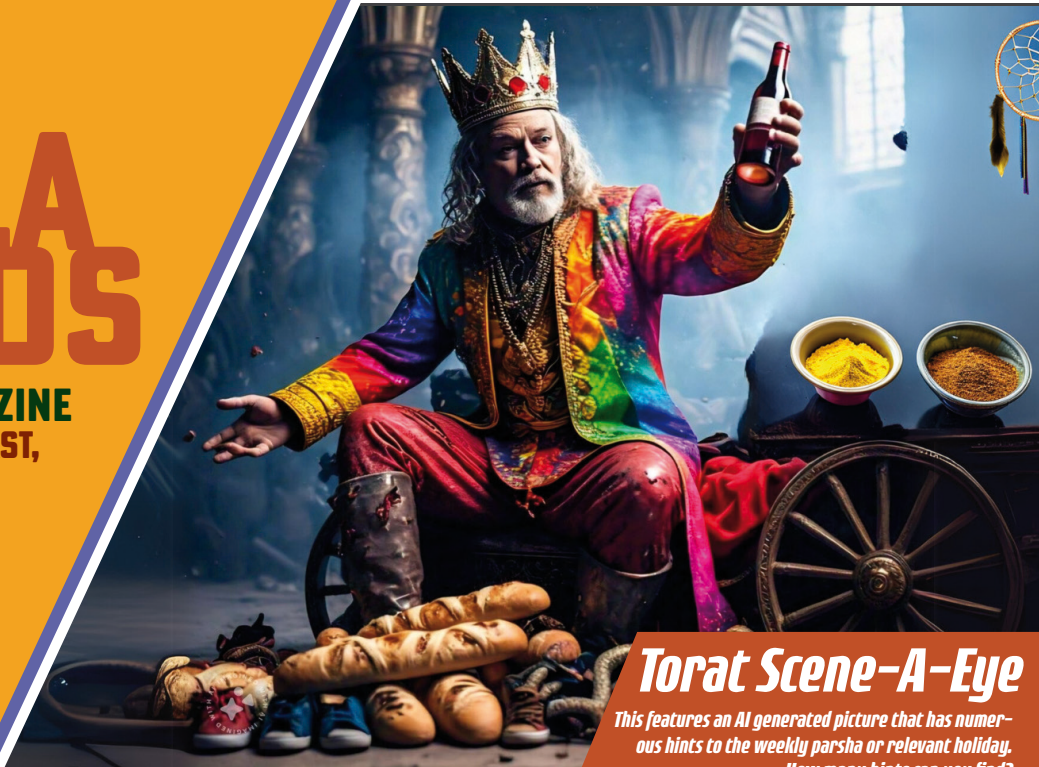
Disclaimer: These AI generated images are NOT meant to portray actual people or events from the Torah. They are simply hints to get you thinking.