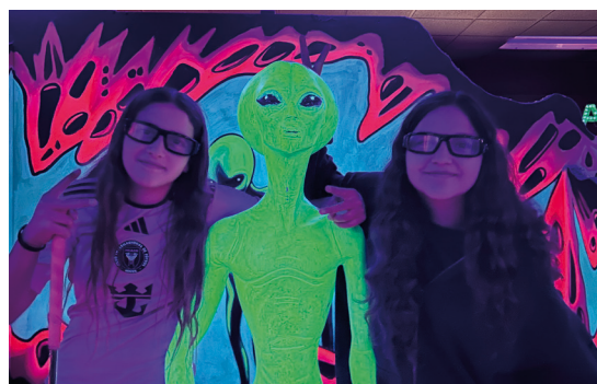
PHOTO TAKEN AT IMAGINE 3D MINIGOLF IN SCOTTSDALE AT A JEWNIOR NCSY EVENT THIS WEEK.