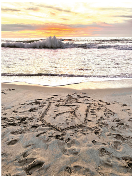
LOVE LOVE LOVE THESE PHOTO CONTEST ENTRIES!