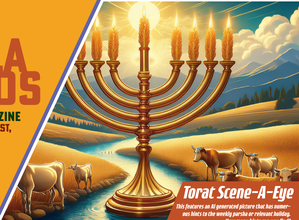
Disclaimer: These AI generated images are NOT meant to portray actual people or events from the Torah. They are simply hints to get you thinking.